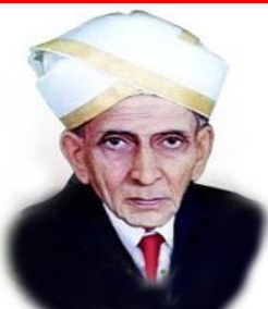
Sir M. Visvesvaraya

Let us all pledge on this day to strive for emulating the qualities of this great engineer.